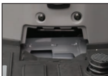
Drain on the Floor