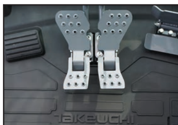
Foldable Travel Pedal (optional)