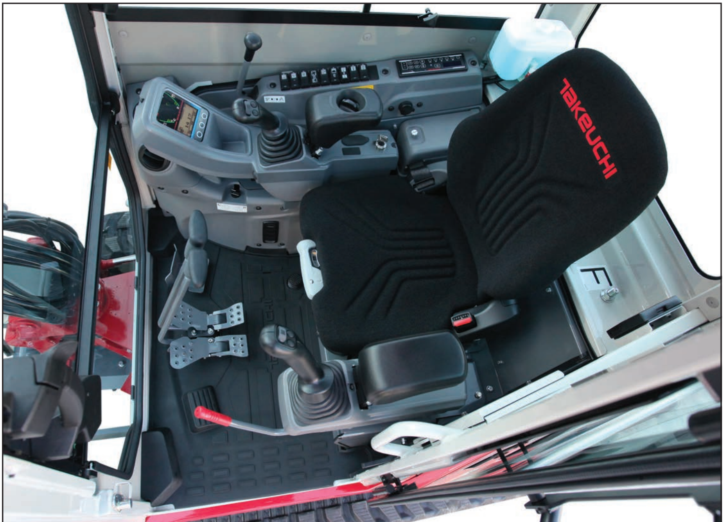
Spacious Operator's Station with Easy to Reach Controls and Switches

Standard features on the TB325R include an automatic fuel bleeding system which eliminates the need to manually prime the fuel system, automatic engine deceleration which helps conserve fuel, drain on the floor provides easier clean out and a heavy-duty wraparound counterweight which helps protect vital machine components. Additional features available on the TB325R include an LED work light package, multiple auxiliary hydraulic circuits, and an optional Takeuchi Fleet Management (TFM) telematics system.