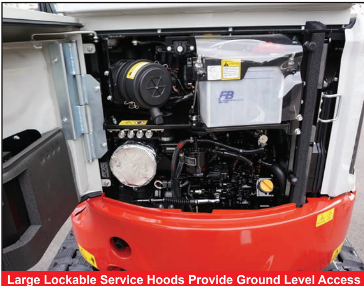
Large Lockable Service Hoods Provide Ground Level Access